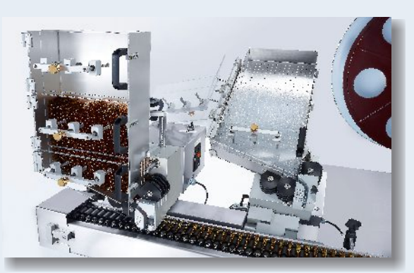
Ampoule/vial loading cassette can be refilled while the machine is running